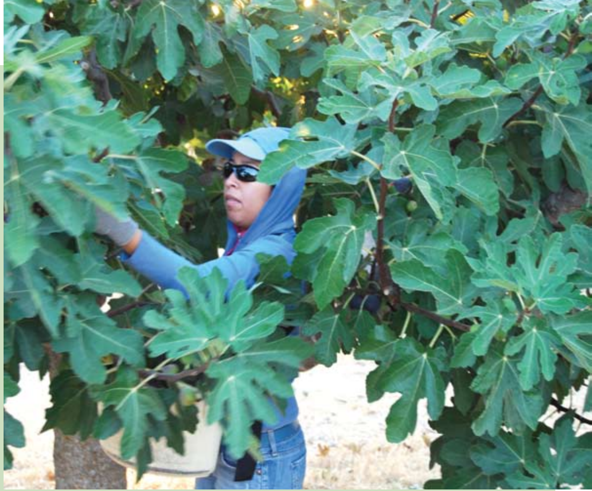
Because figs ooze a white latex liquid that can be toxic, workers wear long sleeves and gloves while picking.

If you're shopping for fresh figs, an article in Fine Cooking magazine recommends choosing figs heavy for their size and slightly soft, even those a little wrinkled, possibly with cracks in the skin. Both very firm and overly squishy figs should be avoided, as should figs with mold. But if a little mold appears on a counter-ripening fig, just scrape it off with a knife, rinse the fig, and pop it right in your mouth. Many chefs recommend letting figs sit on the counter, with space around them for air to circulate and ripen them; others storing in the refrigerator.